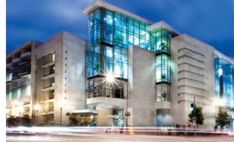
Walter E. Washington Convention Center

2017 International Information Sharing Conference